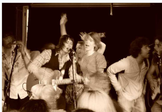
Dimestore Recordings live @ Sweeney's

All tapas boards can be served individually or as a mix of 3 of the above at €20.00 Each board serves approximately 6 - 8 persons